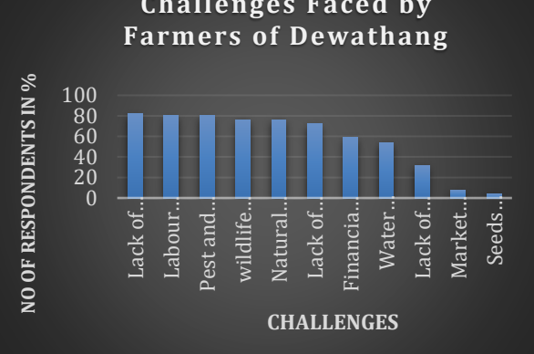
Figure 3: Challenges faced by famers

Entrepreneur farmers of Dewathang are not able to do commercial farming despite having access to market places like Jigme Namgyel Engineering College, Chokyi Gyatso Institute, Royal Bhutan