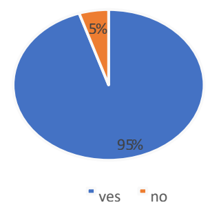
Figure 1: Market Analysis

Upon surveying, the group found out that there are potential customers like Jigme Namgyel Engineering College, Royal Bhutan Army Complex, Dungsum Academy, and Chokyi Gyatso Institute, which normally do not do farming and provides opportunity for marketing local products. 95% of the respondents agreed that they are ready to purchase locally available vegetables and fruits from farmers if they are made available. Whereas 5% of the respondents were not sure whether to purchase from framers due to the high price charged by farmers.